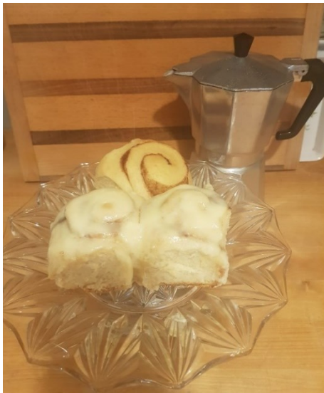
Entry 33 – Cinnabon Covid Comfort