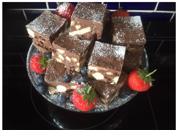
Entry 14 – Lockdown Chocolate Tiffin