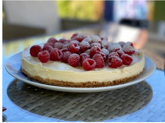
Entry 2 – Lemon Cheesecake