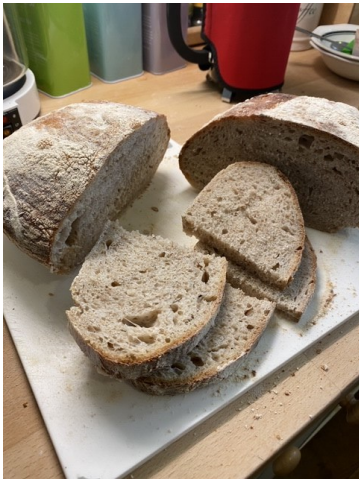
Entry 25 – Sourdough Bread