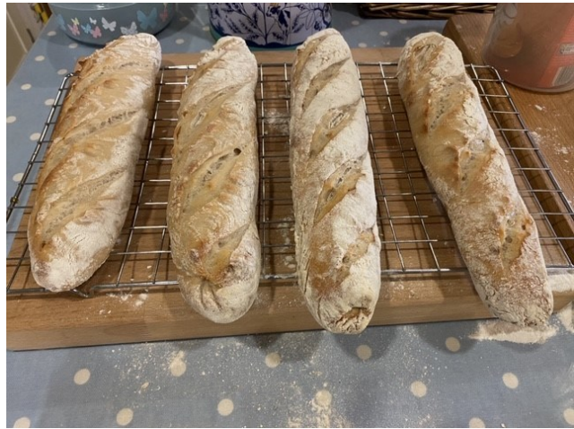
Entry 28 – Fresh French Baguettes