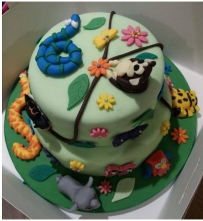
Entry 15 – The Rainforest