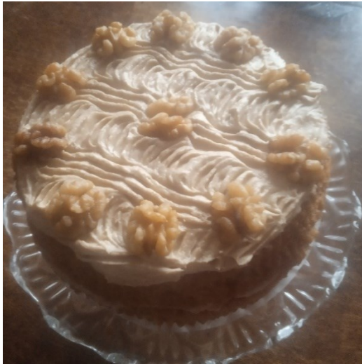
Entry 19 – Coffee Cake