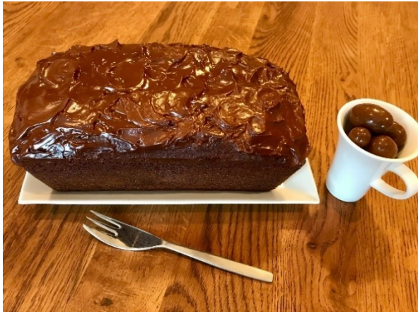
Entry 10 – Chocolate and Soured Cream Loaf Cake