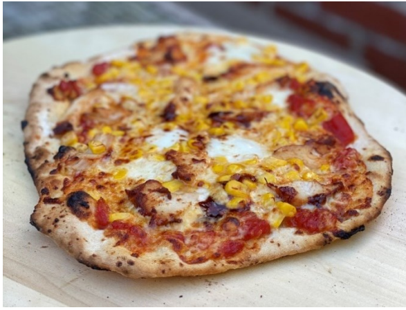
Entry 31 – BBQ Chicken Lockdown Pizza