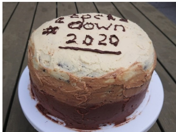
Entry 4 – Triple Chocolate Lockdown Cake