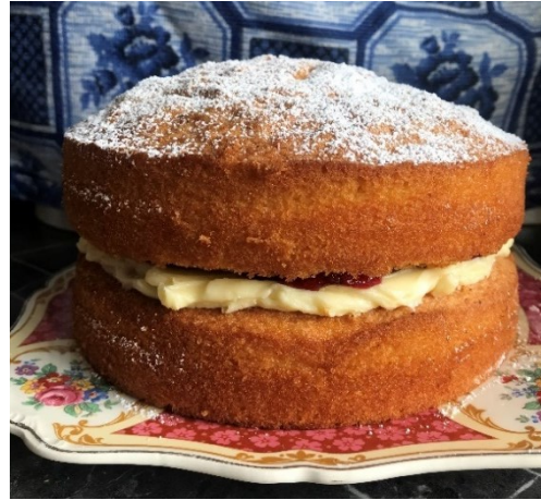
Entry 7 – Victoria Sponge