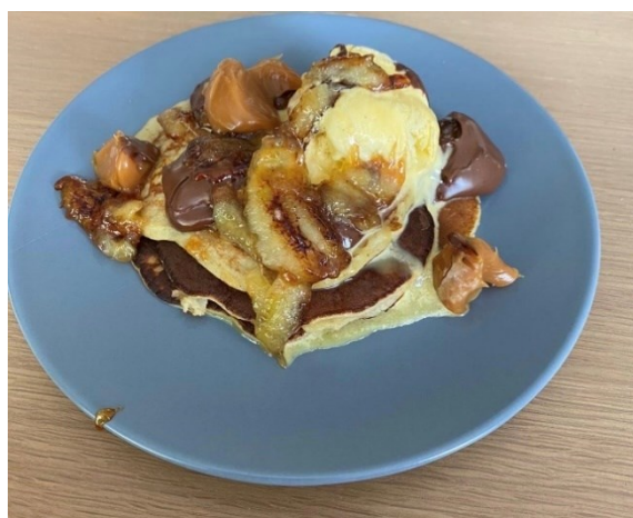
Entry 30 – Banana licious