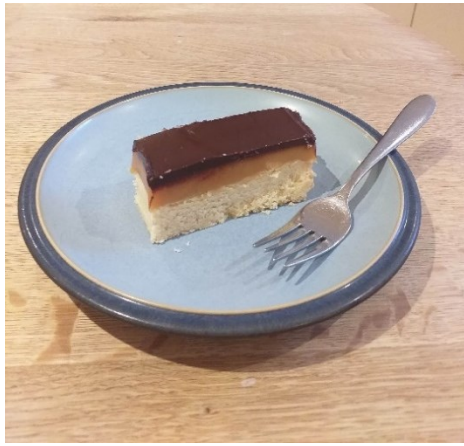
Entry 5 – Hannah's Millionaire's Shortbread