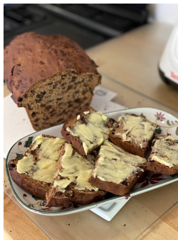
Entry 24 – Tea Bread