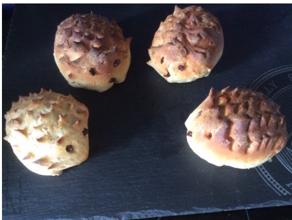
Entry 13 – Hedgehog Bread Rolls