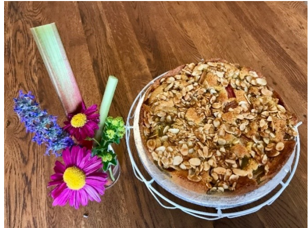
Entry 11 – Home Grown Rhubarb and Orange Cake