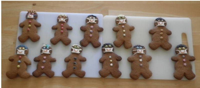
Entry 3 – Socially Distanced Gingerbread People