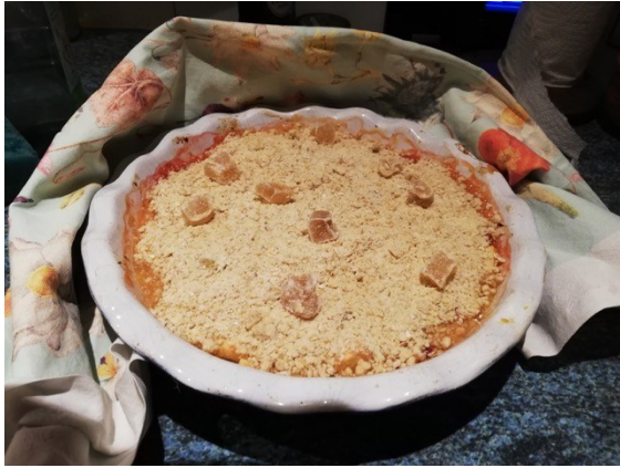
Entry 6 - Rhubarb crumble with oaty top, decorated with crystallised ginger