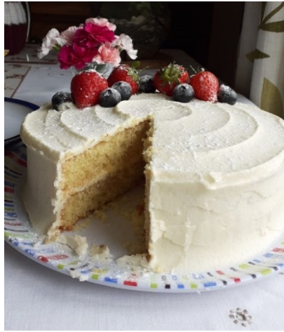
Entry 32 – Gluten Free Lemon Sponge