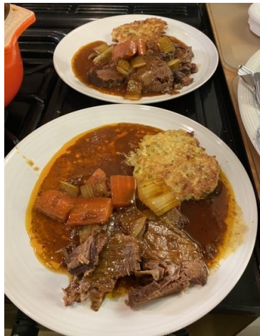
Entry 26 – Plated up Brisket of Beef with Potato Latkes