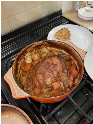
Entry 27 – Pot Roast Brisket of Beef