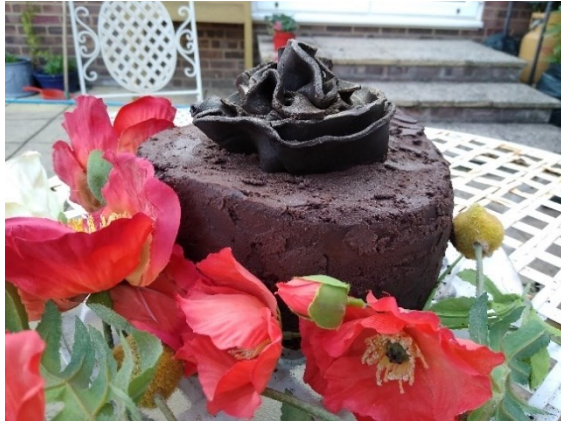
Entry 1 – Chocolate Flower Cake